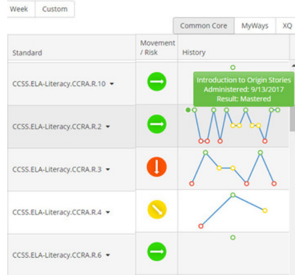
Teacher View: Performance By Standard